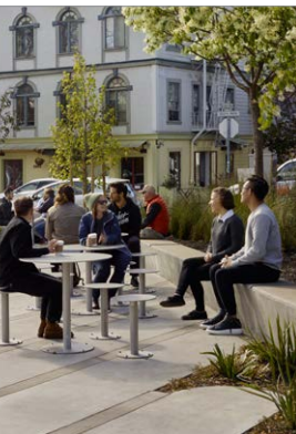
tables and seats