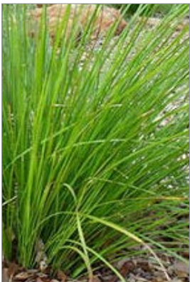
Lomandra longifolia 'Tanika' Tanika Mat Rush