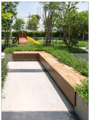
seating and raised planter