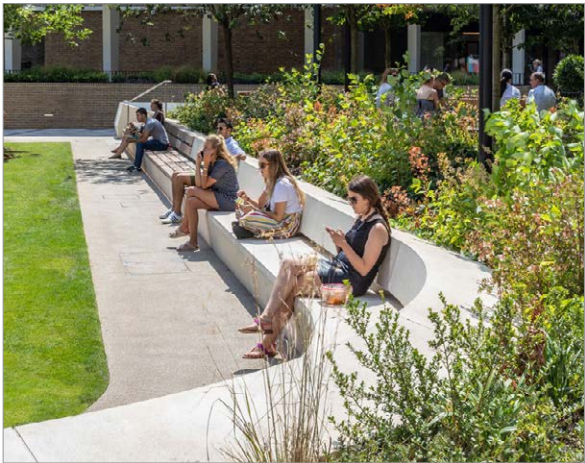
multi-use • civic character • social interaction • seating and engaged observation • meeting and congregating • active play PRECEDENT IMAGES