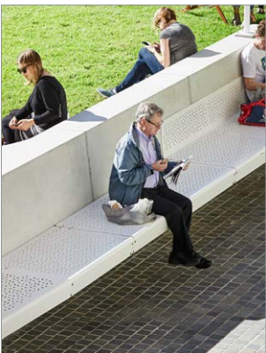
concrete retaining wall