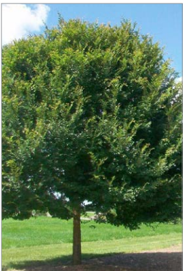
Ulmus parvifolia Chinese Elm