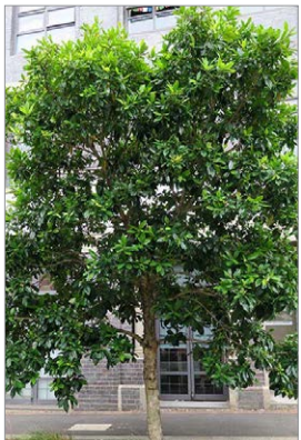
Tristaniopsis laurina 'Luscious' Water Gum