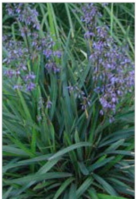
Dianella caerulea 'Little Jess' Dianella 'Little Jess'