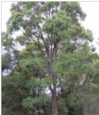
Angophora floribunda Rough-barked Apple INDICATIVE PLANT SPECIES