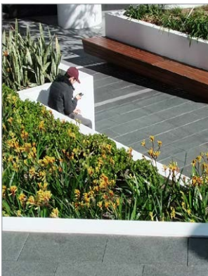
seating and raised planter