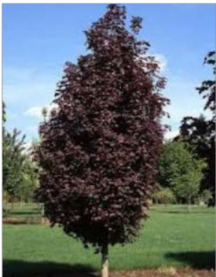
Acer platanoides 'Crimson Sentry' Purple Norway Maple